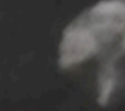
SHREYAS M B