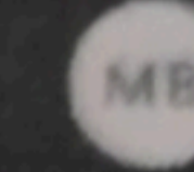
SHREYAS M B