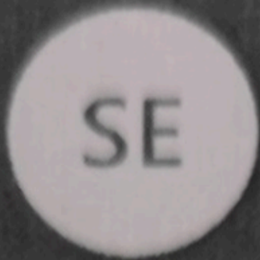
Sherif of Civil Engineering