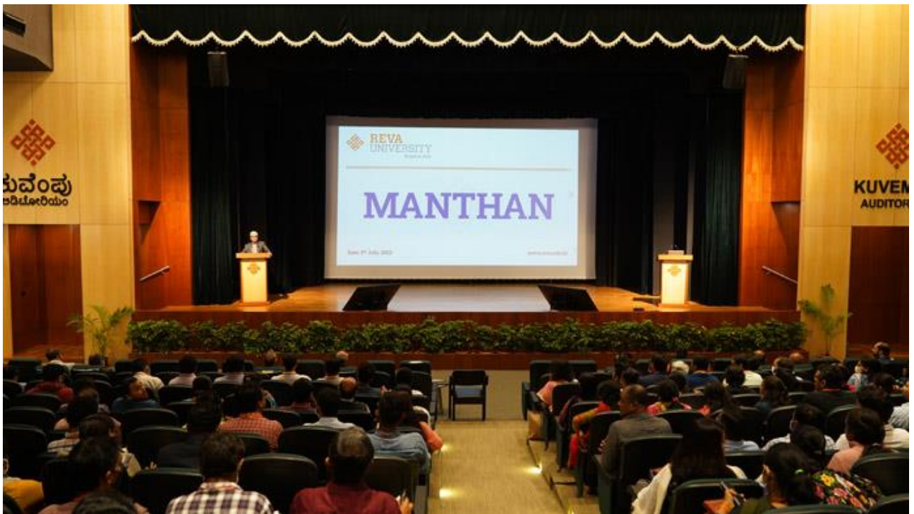
Chancellor, REVA University addressing the employees during the Manthan Program

Manthan is a yearly meeting 7rganized by REVA University that is built on fostering the bond between its staff and management. Manthan encourages professional development, encourages employee engagement and builds leadership through the organisations core values.