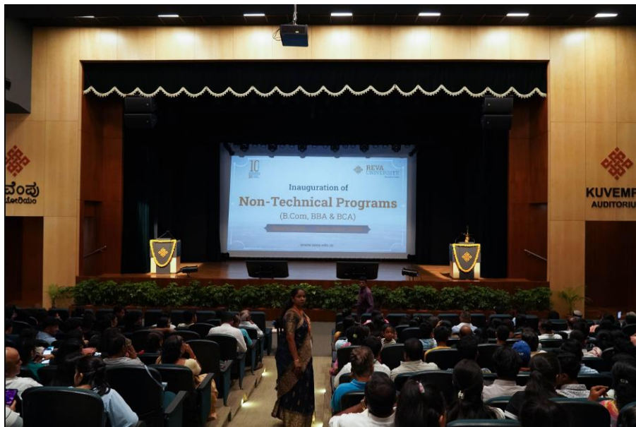
Inauguration Programme at Kuvempu Auditorium at REVA University