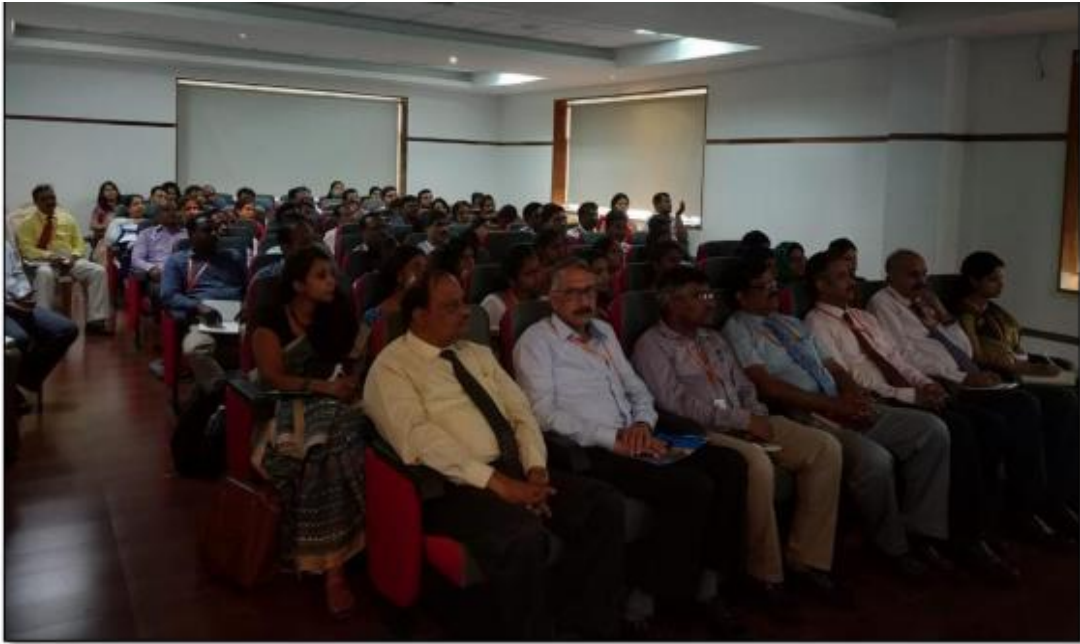
Newly joined Faculty members during their induction programme at REVA University