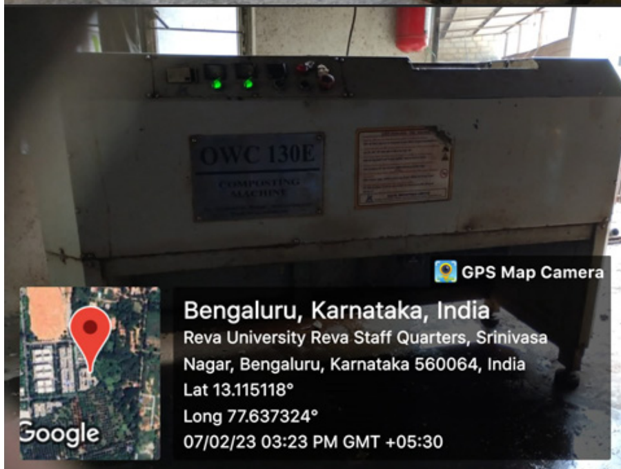
Filtration Unit, Electrical outlet and activated carbon filters Sewage Treat Plant, REVA University

Registrar REVA University Bengaluru - 560 064