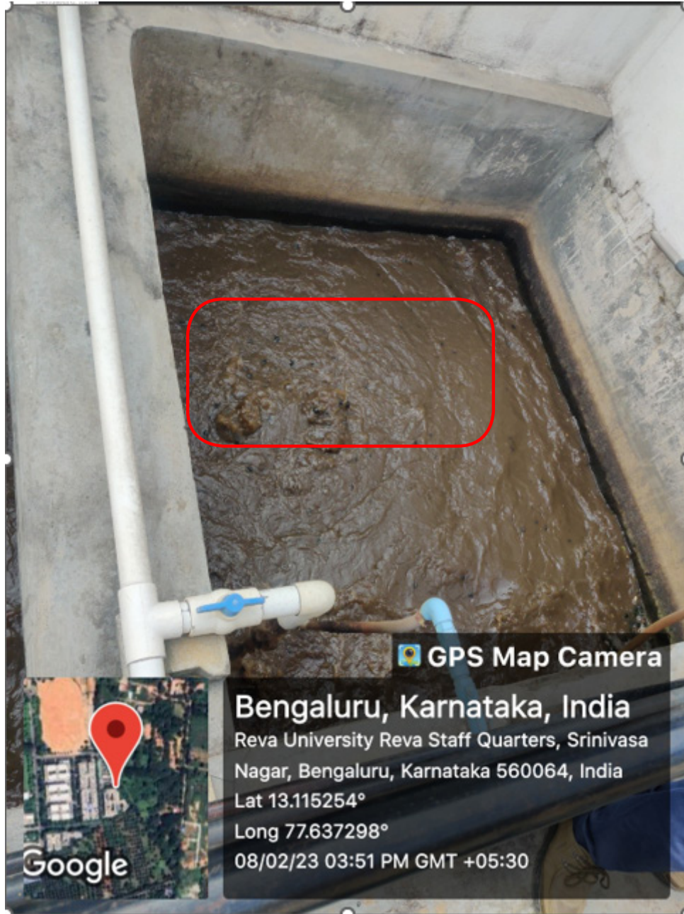
Wastewater treatment unit after pumping Block: Sewage Treatment Plant, REVA University

Registrar REVA University Bengaluru - 560 064