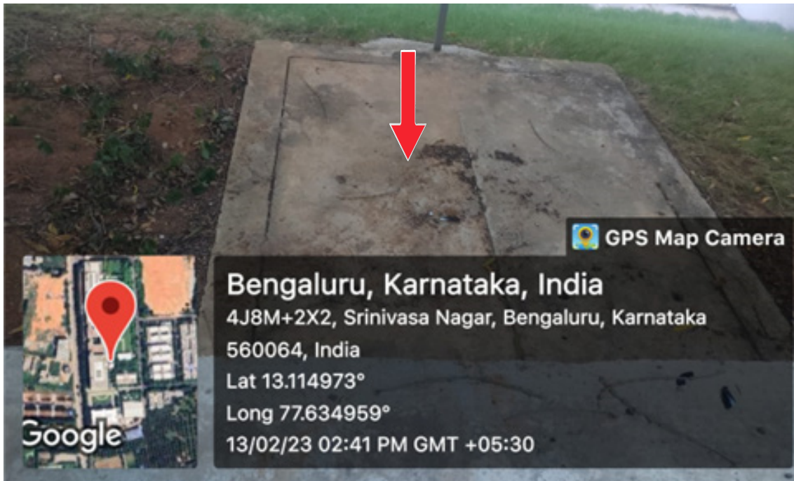
Water bund - Vivekananda Block , REVA University