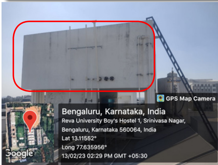
Water tanks Block- REVA Students Hostel