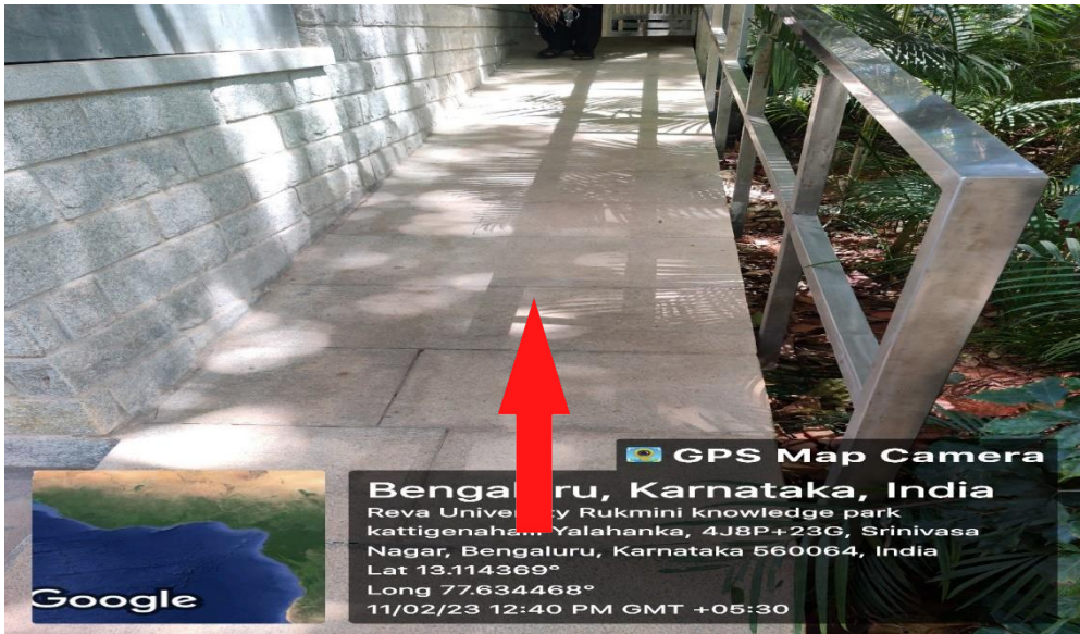
Ramps Location: Saugandhika, REVA University